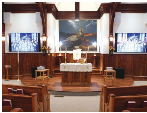
The interior of Salem Evangelical Lutheran Church was beautifully restored after the 2023 fire that severely damaged the church.