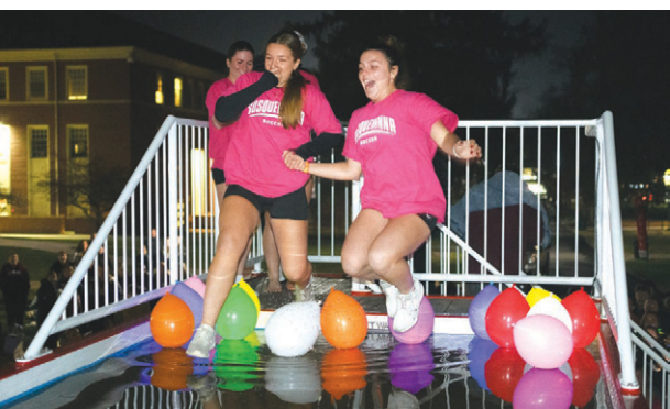
Two student-athletes from Susquehanna University’s women’s soccer team participate in a Polar Plunge to benefit Special Olympics.

Susquehanna University’s Student Government Association and Office of Leadership & Engagement hosted a Polar Plunge to raise funds to benefit Special Olympics. The event raised more than $23,000, exceeding Special Olympics’ goal of $20,000. The university’s women’s soccer team raised the most at $5,000.