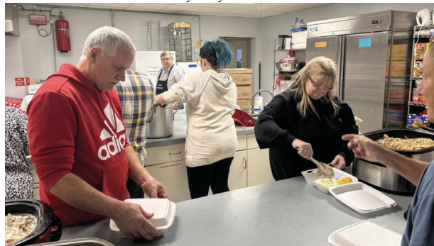
Volunteers work in the kitchen to prepare meals for Feed 500 for Thanksgiving.