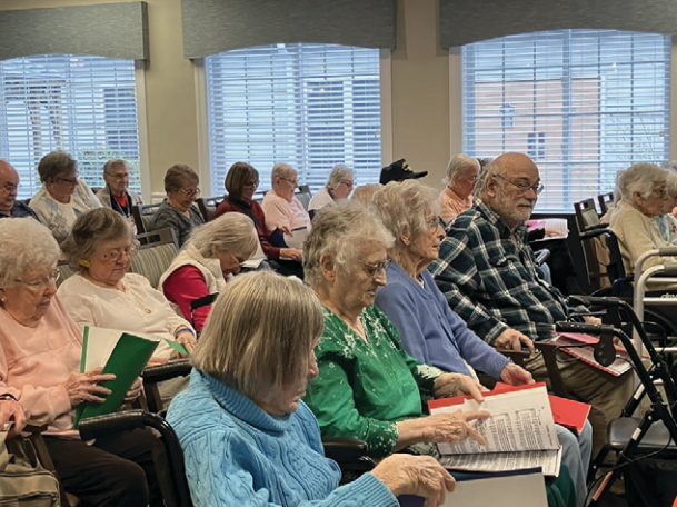
Residents at Brookdale Grayson View enjoyed Tunes and Tea with members of the Snyder County Chapter of PASR.

Members of the Snyder County Chapter of PASR recently hosted a festive tea filled with music, laughter, delicious homemade cookies and snacks for the residents of Brookdale Grayson View.