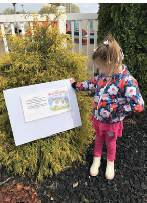
StoryWalk has returned to East Snyder Park thanks to the efforts of The Friends of the Gelnett Library. Stop by and enjoy a reading stroll of “Sheep Take a Hike.”

books have a theme such as kindness, anyone can make a difference in someone’s life, a love for nature, accepting differences, and more. After reading the StoryWalk selection, the child and caregiver might even want to visit their local library!