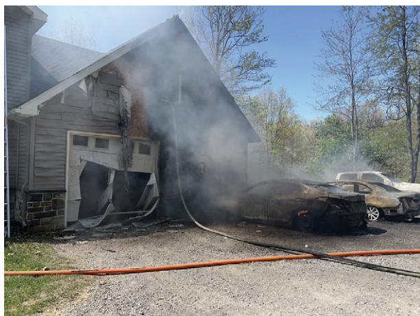
On April 27, 2025, a fire broke out on Red Haven Drive in Monroe Township.