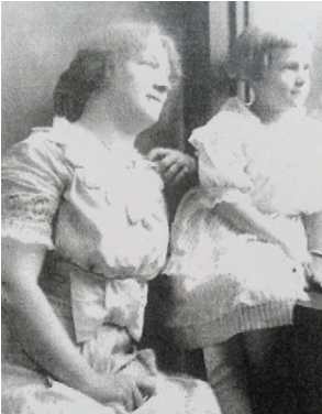
Who is this woman and what is her 'overlooked story'?

History is filled with tales of men who helped to build our towns and shape our past, present and future. But what about the women? Where are they? What role did they play? What contributions did they make and why did they appear to “fall through the cracks” of our town’s history?