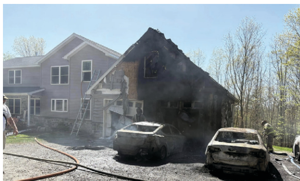
hanna Regional 911 advised that the caller was calling Due to the teamwork between all of the fire departments in the region, much of the structure and contents were saved.

On Sunday April 27, 2025, at 2:07 pm, the Hummels Wharf Fire Company was dispatched for a Smoke Investigation in the area of Kratzerville Road in Monroe Township. Chief 73 (Moyer), Engine 70, and Fire Police responded. Central Susque-