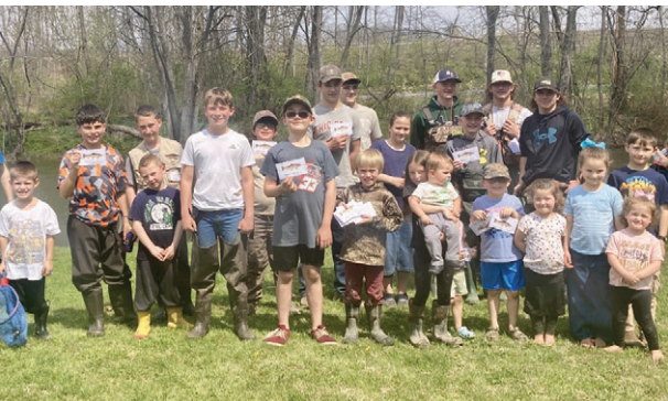
Congratulations to the prize winners in the Annual Youth Fishing Day event hosted by The Iron Bridge Trout Stocking Group.