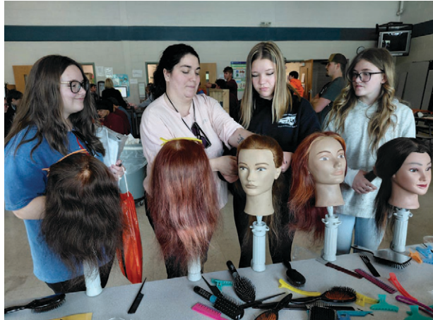
A popular program at SUN Tech is their Cosmetology Program where student learn to cut and style hair and polish nails.