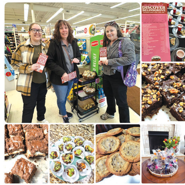
I ran into these three ladies on their very last stop at Cole's Hardware where they were completed their passports. Pictured are some of the amazing chocolate desserts which could be found along this year's Chocolate Stroll.

Chocolate lovers from all over the area set out to take part in this year's Chocolate Stroll held in Selinsgrove on Saturday, April 11, 2026. Hosting this event for the ninth year, the Selinsgrove Chamber of Commerce encourages its members to invite participants into their businesses to shop and sample a variety of delicious chocolate creations.