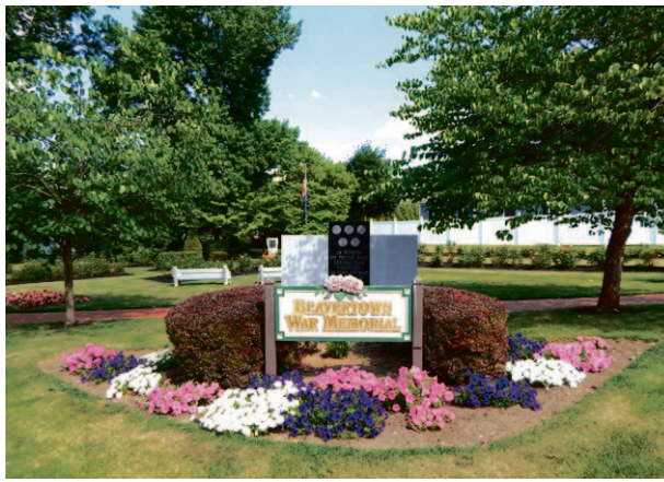
The Beavertown War Memorial Rose Garden needs community donations to blossom.