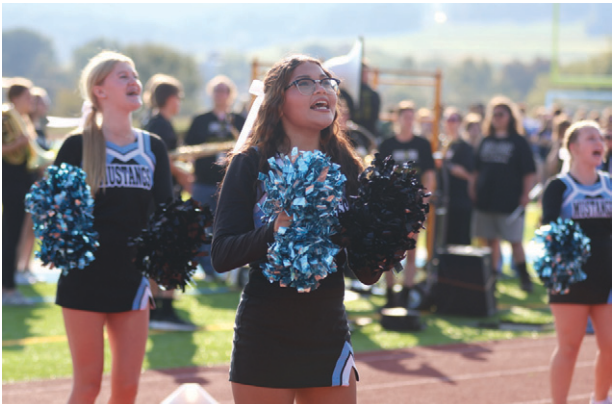
From beginning to end, the cheerleaders kept the momentum going and pumped up the student body with a variety of audience participation cheers.