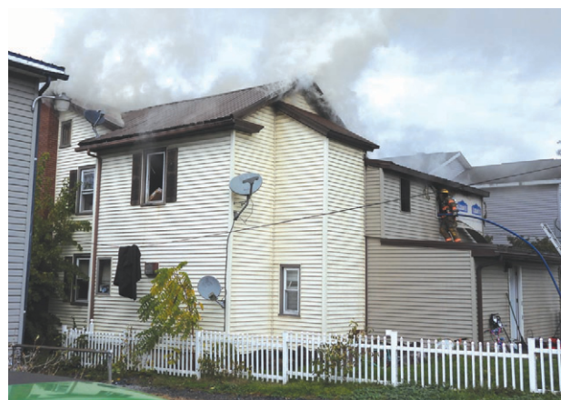
A porch fire in the 400 Block of East Main Street caused moderate damage to the second floor. Six occupants were displaced.