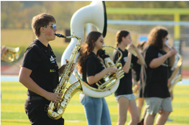
The Midd-West High School Marching Band performed throughout the pep rally entertaining the students.