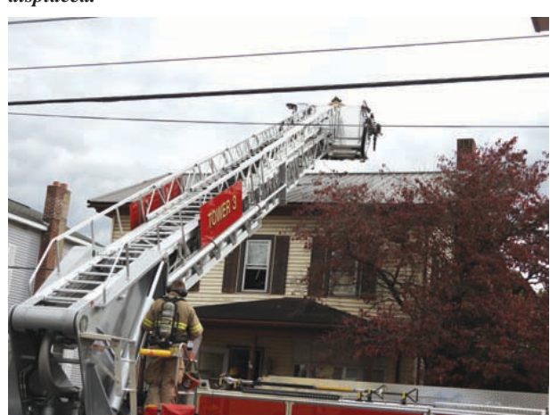
Mifflinburg Hose Company Tower 3 was used to vent the roof of the house. The porch fire started in the rear of the building.