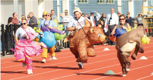
Laughter filled the stadium during the Teacher Olympics as students rooted for teachers representing their school.

The Midd-West High School stadium was filled with over 2,000 students from grades K-12 from across the district to celebrate 100 Years of Education at Midd-West High School. The event kicked off with a pep rally energizing the study body for Mustang Spirit Day.