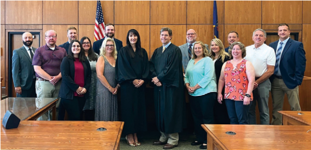
Snyder County honored community Corrections Professionals during Pretrial, Probation, and Parole Supervision Week on July 20-26, 2025 for their tireless work within the community.