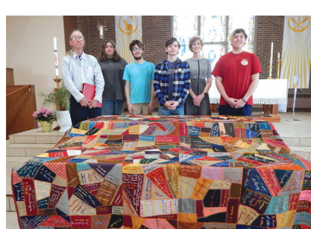
The Signature Quilt at the Snyder County Historical Society brings history to life. See all the hand-stitched names on the Crazy Quilt at Heritage Day on August 17 from noon- 4 pm.