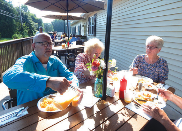
Approximately 24 attendees enjoyed Breakfast on the Patio at the Beaver Springs Senior Center.