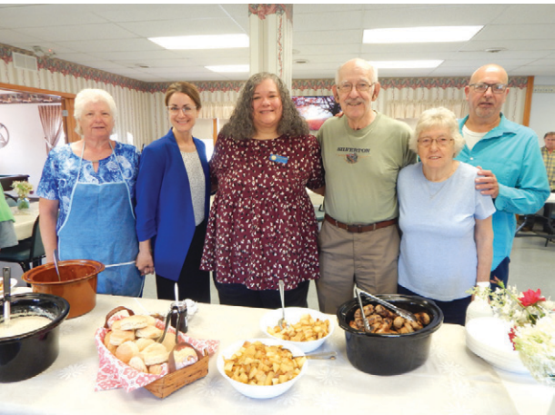
The scrumptious buffet was a wonderful way to celebrate “Breakfast on the Patio” as the inaugural event unveiled the newly furnished patio.