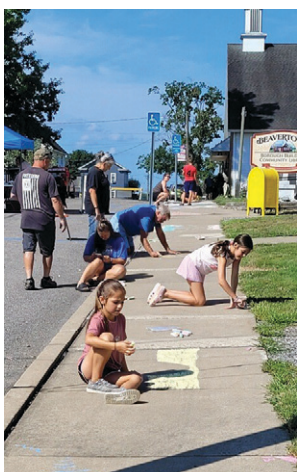
Children, young and young-at-heart, participated in the Chalk Festival at the Beavertown Community Library