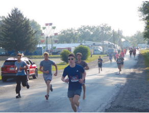
Participants sprint off as the 5K Race/Walk sponsored by the Middleburg Area Kiwanis Club gets underway. The event benefits the Seven Bridges District Scout Units and other Middleburg Area Community Youth Groups.