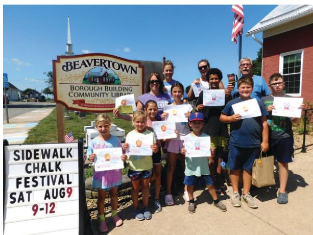
Winners of the first inaugural Chalk Festival at the Beavertown Community Library pose with their citations. It was a family-friendly, fun-filled event.